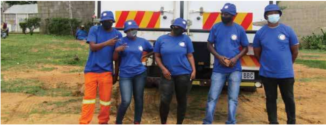
Basebetsi ba Net Supply Group Pty Ltd