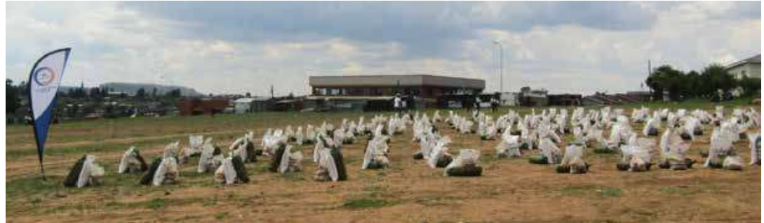
Liphutheloana tsa lijo ho tsoa Net Supply Group Pty Ltd